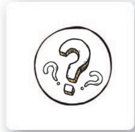
Question (small) cards

Prepare the cards with questions. Put the question (small) cards (select as many as you feel adequate to your group of children) to the different paths – any place you select should be fine. Children will randomly step on it. When they step on it, turn up a question card with the instructions – ask the children to reply, then read the explanation.